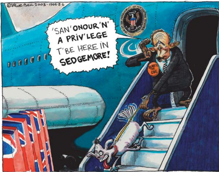
George W Bush returns to support his candidate